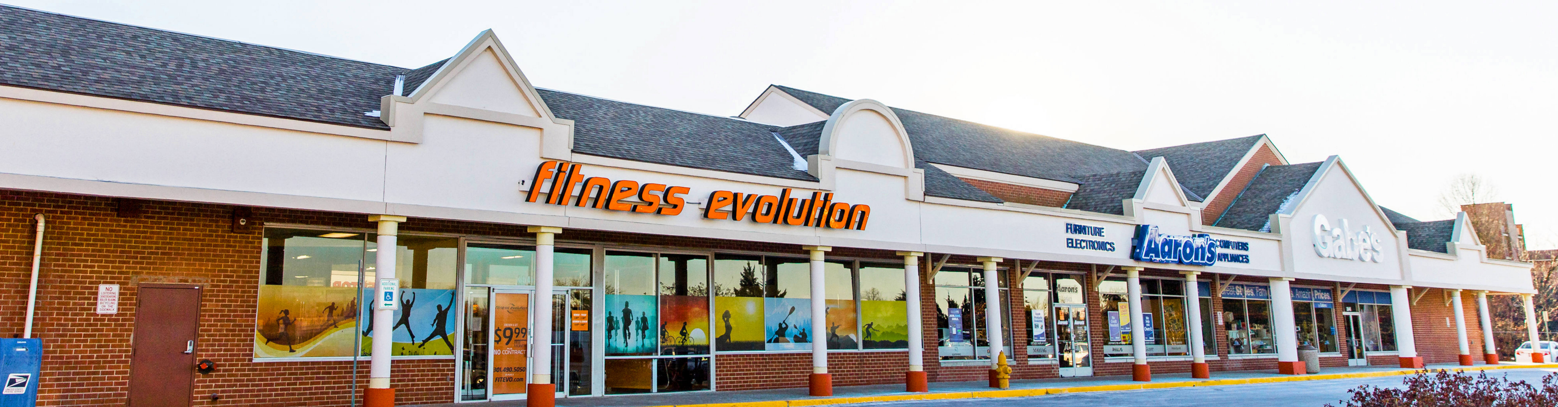
Brockbridge Shopping Center